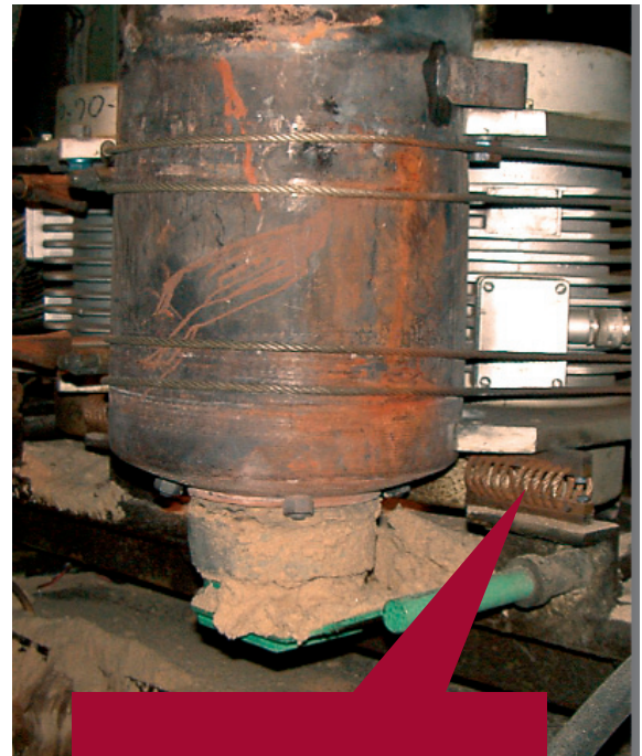
4.2 and 2 Core Line Isolators

In preparation for the casting operation of engine blocks, sand is loaded into a mixer and mixed into the desired consistency. The mixers are typically located on the second or third floor of the plant and often times the mixing procedure would send vibrations through the floor to the lower levels. To prevent this disturbance, the mixers were isolated using spring isolators. This solution did not provide the isolation required. The customer then used the elastomeric (rubber) isolators that were provided by the mixer manufacturer, but they wore out often and had to be replaced monthly. ITT Enidine Inc. suggested installing WRI because the steel cabled isolators would last much longer than the elastomeric isolators. After fine-tuning the WRI in the application, the maintenance required to change the elastomeric isolators was reduced from every 2-3 weeks to minimal maintenance in over 9 months.